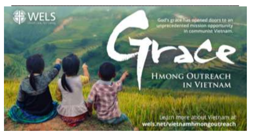
SPECIAL MISSION EMPHASIS SUNDAY, FEB 10 9 AM Sunday School Children Sing + Special Offering Handouts with more info & giving envelopes in entryway

Less 1 - God: My 1 Desire Less 2 - Creation Glorifies The Creator Less 3- God's Holy Name Is All Hearts Need Less 4 - 31,173 Verses, 1 Big Idea (NEXT SUNDAY - Feb 10) Less 5 - God Makes Eternity Exciting Less 6 - Jesus Gets Us To God Less 7 - Christians Are Called To Declare God's Glory!